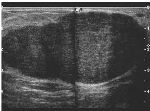
Giant Fibroadenoma of 14 yof